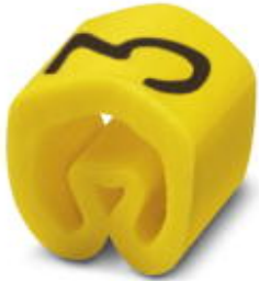
Conductor marking collar, Labeled with the number: Numbers, yellow, width: 3.2 mm

Please be informed that the data shown in this PDF Document is generated from our Online Catalog. Please find the complete data in the user's documentation. Our General Terms of Use for Downloads are valid ( http://phoenixcontact.com/download )