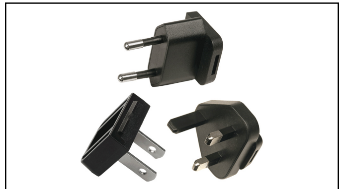
Figure 2. Interchangeable power adapter plugs included with the Mini Zero Volt Ionizer 2