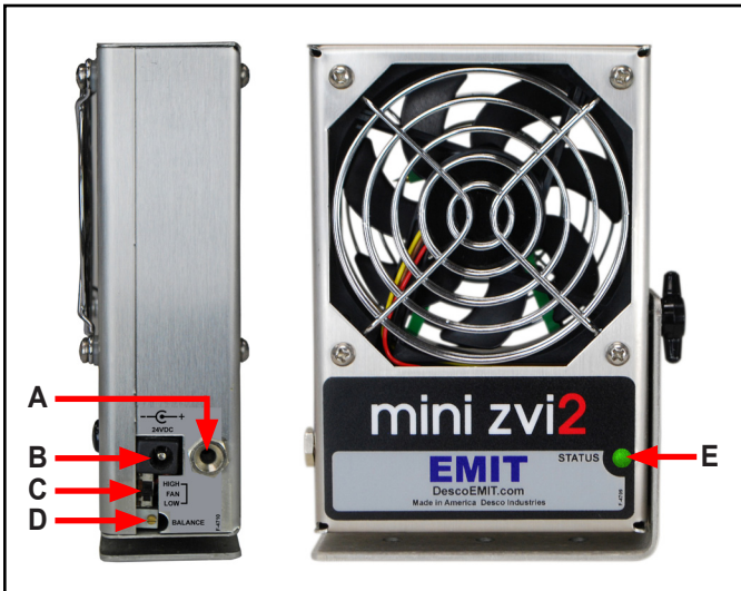
Figure 3. Mini Zero Volt Ionizer 2 features and components

A. Ground Jack: Insert the banana plug end of the included ground cord to this jack. Connect the ring terminal end of the cord to equipment ground.