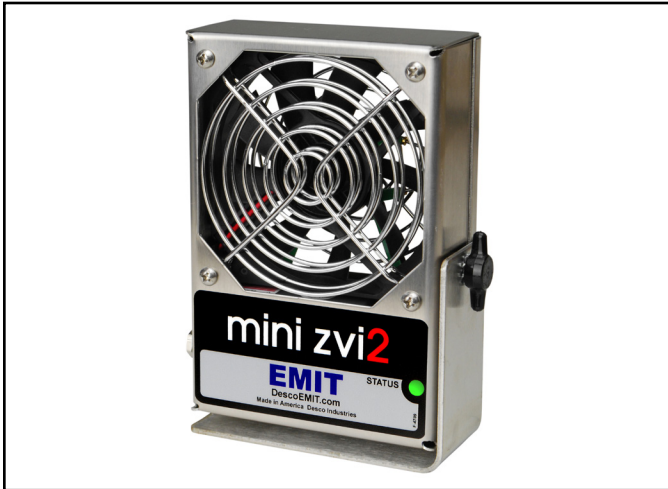
Figure 1. EMIT 50642 Mini Zero Volt Ionizer 2