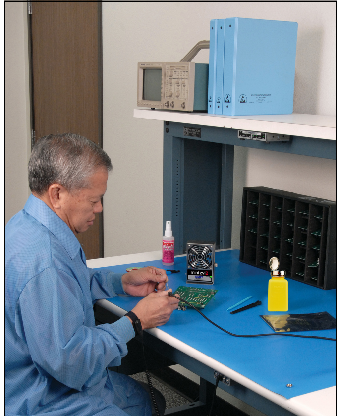
Figure 4. Using the Mini Zero Volt Ionizer 2 at a workstation.