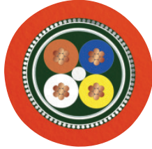
Sercos III [93K]