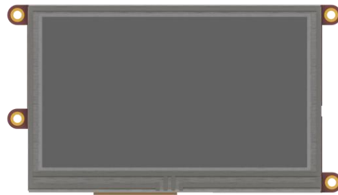
The uLCD-43DT Display Module