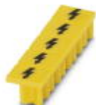
Warning cover, 5-pos., for terminal width: 5.2 mm

Zack Marker strip, flat - ZBF 5 CUS - 0825025