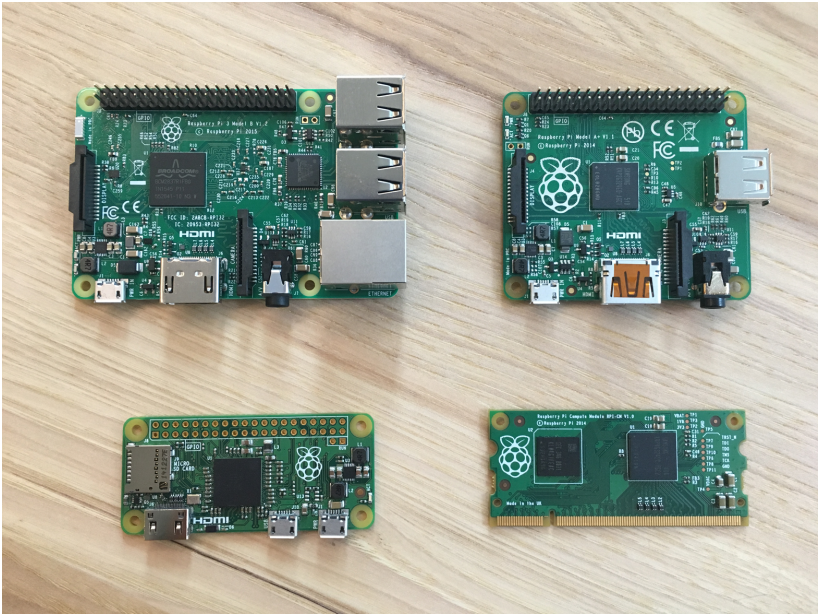
Figure 1-1. There are many versions of the Pi, and here are a few (clockwise from top left): Raspberry Pi 3 Model B, Raspberry Pi 1 Model A+, Raspberry Pi Compute Module, and Raspberry Pi Zero. As of February 2016, Raspberry Pi 3 Model B is the latest mainline Raspberry Pi.

Let's start with a tour of what you'll see when you take your Raspberry Pi out of the box.