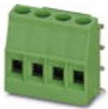
PCB terminal block, Nominal current: 24 A, Nom. voltage: 400 V, Pitch: 5 mm, Number of positions: 4, Connection method: Screw connection, Mounting: Soldering, Conductor/PCB connection direction: 0 °, Color: green, Article with lateral pin exit

Basic terminal block - MKDSO 2,5/ 4-R - 1707247