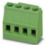
PCB terminal block, Nominal current: 24 A, Nom. voltage: 400 V, Pitch: 5 mm, Number of positions: 4, Connection method: Screw connection, Mounting: Soldering, Conductor/PCB connection direction: 0 °, Color: green, Article with lateral pin exit

Printed-circuit board connector - MKDSO 2,5/ 4-L - 1707234