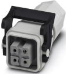
HEAVYCON QUICKON coupling housing A3, with single locking latch, 3-pos., with PE connection, socket, QUICKON connection, straight cable outlet

Please be informed that the data shown in this PDF Document is generated from our Online Catalog. Please find the complete data in the user's documentation. Our General Terms of Use for Downloads are valid ( http://phoenixcontact.com/download )