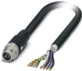
Assembled Ethernet cable, CAT5e, shielded, 8-wire, 4 x 26 AWG (data) and 4 x 20 AWG (power), RAL 9005 (black), M12 hybrid plug to free cable end, length: 5.0 m

Please be informed that the data shown in this PDF Document is generated from our Online Catalog. Please find the complete data in the user's documentation. Our General Terms of Use for Downloads are valid ( http://download.phoenixcontact.com )