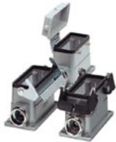
Box mounting base, with double locking latch, height 67 mm, with screw connection, 1x Pg21

Please be informed that the data shown in this PDF Document is generated from our Online Catalog. Please find the complete data in the user's documentation. Our General Terms of Use for Downloads are valid ( http://download.phoenixcontact.com )