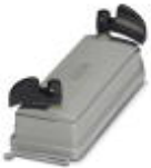
HEAVYCON ADVANCE IP65 protective cover B16, with bayonet locking, with retaining cord, diameter of retaining cord eyelet 3 mm

Protective covers - HC-B 16-TMB-SD-IP65 - 1690956