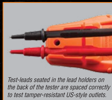
Test-leads seated in the lead holders on the back of the tester are spaced correctly to test tamper-resistant US-style outlets.