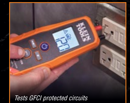
Tests GFCI protected circuits