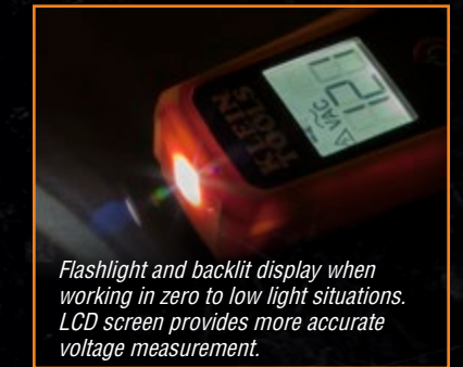
Flashlight and backlit display when working in zero to low light situations. LCD screen provides more accurate voltage measurement.