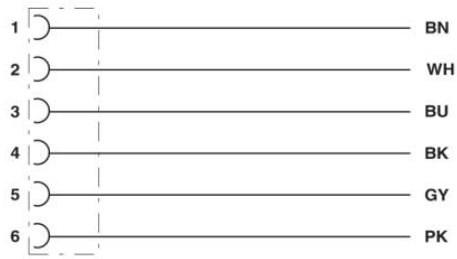
Contact assignment of M8 socket